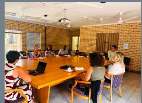
Discussion session and engagement with colleagues from our Vaal Campus

The visit highlighted the value of international partnerships in creating spaces for reflective dialogue, shared perspectives and collaborative growth in teaching, learning, support and educational practice.