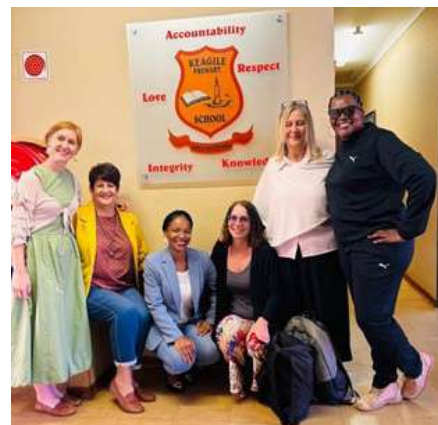
The school visit, collegial discussions & classroom engagements added valuable practical depth to the programme.

Programme highlights included academic meetings and collegial engagement with NWU staff members across various projects and spaces, as well as collaborative article-writing sessions aimed at supporting ongoing and future joint research outputs.