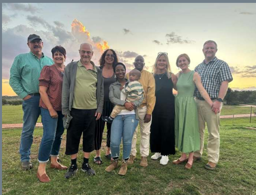
Game drive at Lekwena Wildlife Estate.