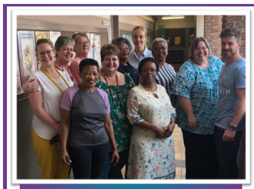
Educational Psychology Lecturers with Potchefstroom Hospital and NG Welfare Staff

After this collaborative exposure, the BEd Honours in Educational Psychology students are equipped to go into their own communities and promote community wellness by independently functioning as registered ASCHP wellness counsellors, which is a much-needed focus in the South African context.