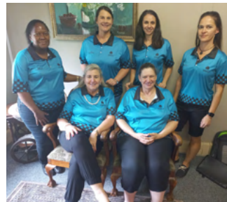
Staff on Vanderbijlpark Campus

Feedback from Potchefstroom Campus Students deemed the R&O Programme to contribute to their knowledge on the overall structure and support provided to them and laughing faces left the venues, ready for 2023!