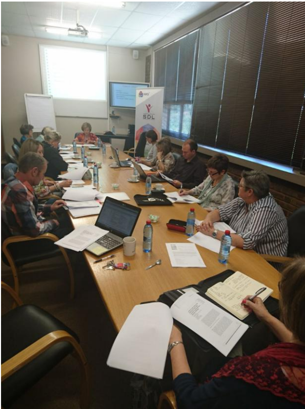
Workshop of 18 October